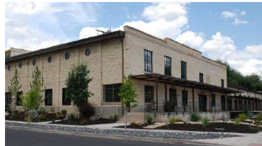
Recent projects: Amanda Knight Hall (Provo), Ephraim Home, Borden Milk Plant Lofts (Logan).