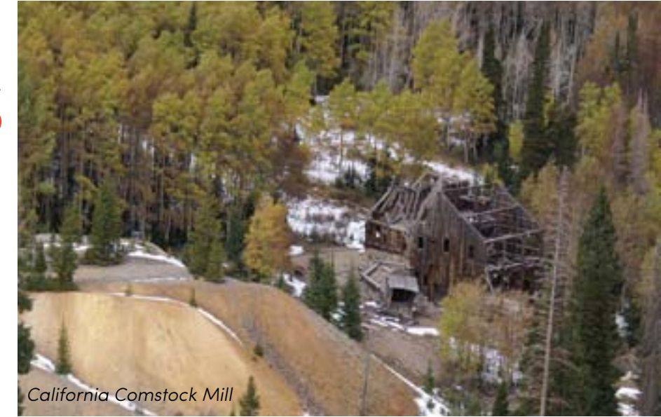
California Comstock Mill