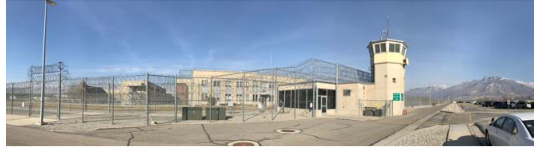
Utah State Penitentiary