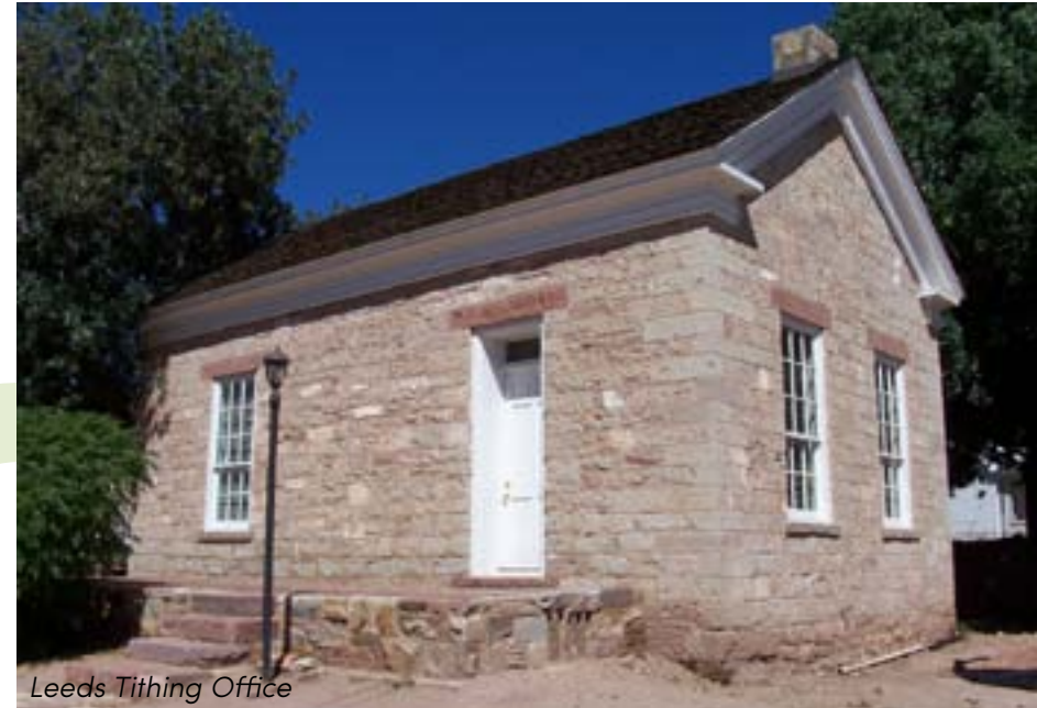
Leeds Tithing Office