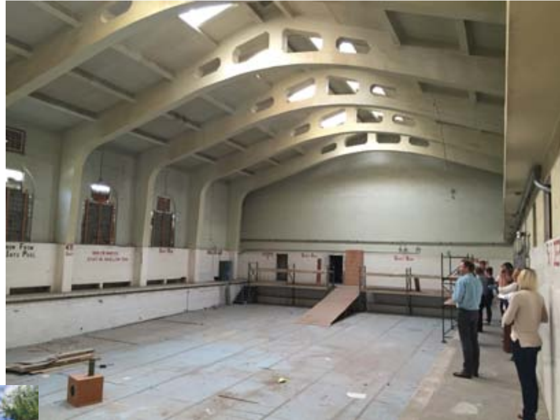
inside Wasatch Spring Splunge Building