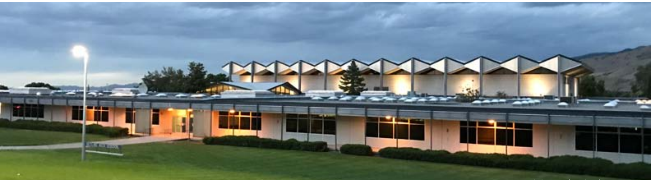
Skyline High School

Salt Lake Modern -- a committee of Preservation Utah -- was founded in 2008 in an effort to document, preserve, and educate the public about mid-century modern design and architecture in the Salt Lake region. In 2017 Salt Lake Modern hosted several events including the launch of a cooperative project, Uncommon Modern. The project includes a crowd-sourced inventory of modern buildings (ca. 1945-1970) and a rotating exhibition. Ultimately, the project objective is to educate the public about the place modernism occupies in Salt Lake and as a means of strengthening the importance of the recent past in our communities.